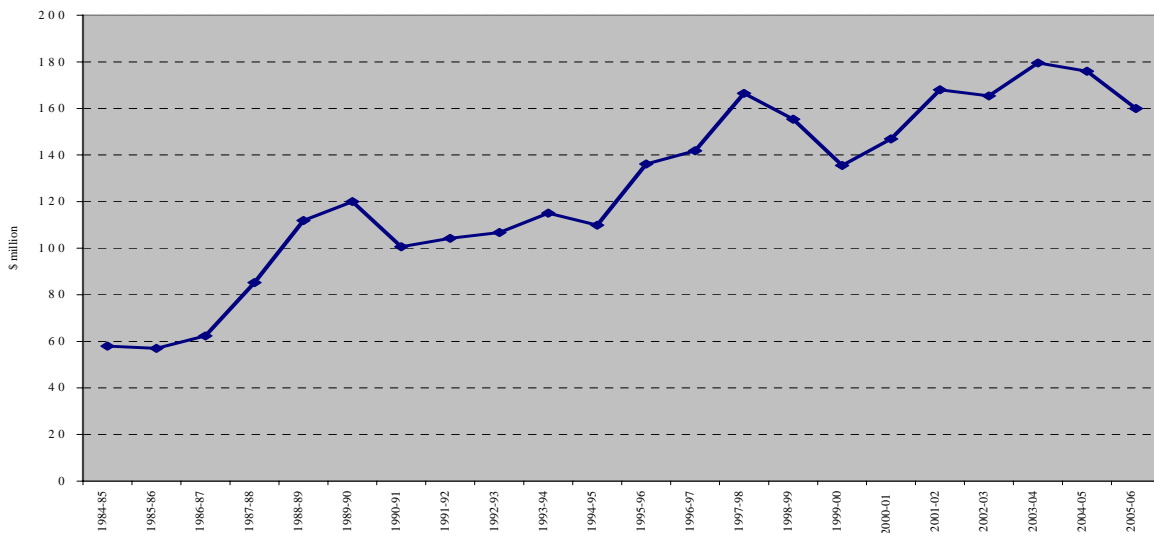
Figure 3: Gross Value of Tasmanian Vegetable Production over Time